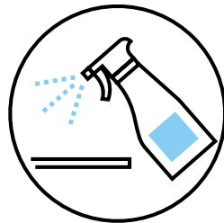
INCREASED AND FREQUENT CLEANING